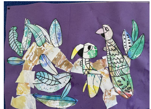
These parrots look great. Students printed, colored, cut then layered the pieces.