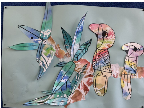
Some completed Junior class art work.

Contact Emma on 0488 185 150 or stawellshow@hotmail.com for more details